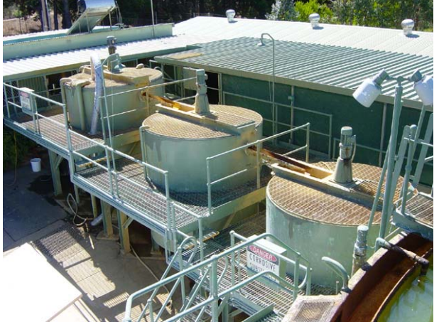
Acid drainage from the site is Figure 3. pumped to the North AMD holding pond (shown) prior to treatment.