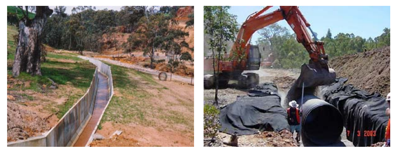
Figure 2. Dawesley Creek diversion drain. Laying pipe for the underground segments of the drain (right) and open channels (left).

In June 2003, Stage 1 of the program, construction of the Dawesley Creek diversion, was successfully completed. The diversion isolates Dawesley Creek from the pollution generated at the mine site. The 1.7 km diversion includes 780 metres of 1.5 metre diameter reinforced concrete pipes, 175 metres of High-Density Polyethylene (HDPE) plastic pipe and 750 metres of drilled and blasted open channel (Figure 2). The original section of creek, adjacent to the waste rock piles, now provides a sink for the collection of acid drainage that previously flowed directly into the creek. Construction of the drain resulted in an immediate improvement in water quality in Dawesley Creek downstream of the mine for the first time in 50 years.