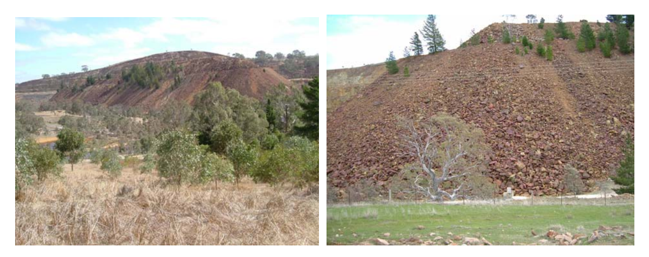
Figure 9. Waste rock piles at the Brukunga site, to be rehabilitated during Phase 3 of the remediation program.

A number of options are being considered for rehabilitation of the waste rock piles. These range from capping of the existing piles to completely relocating the waste rock, either on or off site. A proposal is currently being considered to relocate the 8 Mt of waste rock back to the open cut and blend it with imported limestone marl. At present, cost estimates place this option at $3M/year (AUD) over 7 years. On completion of the waste rock relocation and remediation, it is envisaged that acid seepage from the mine site will significantly diminish, resulting in greatly reduced ongoing treatment and maintenance costs.