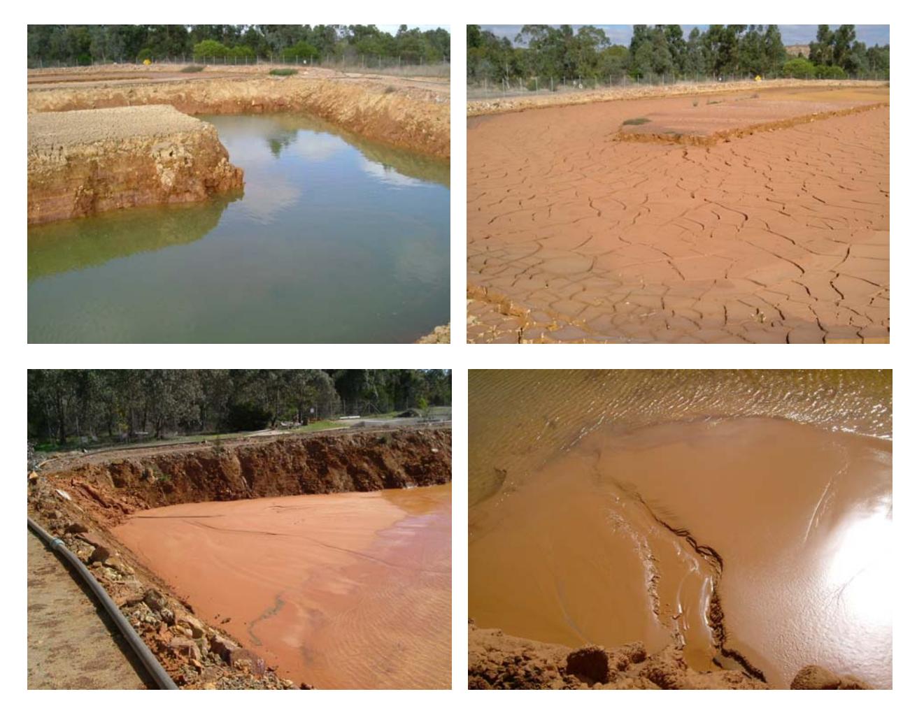
Figure 8. Sludge pond. Low-density sludge prior to plant upgrade partly fills one of the two sludge ponds (upper left). Sludge pond full of partially air dried sludge prior to desludging (upper right). High-density sludge entering sludge pond after plant upgrade (lower left and right).

Examination of the treatment sludge indicates it is dominated by crystalline material (65-75%) of which gypsum (CaSO<sub>4</sub>.2H<sub>2</sub>O) is the dominant phase (Raven and Keeling, 2000; Wollard, 2003 and Earth Systems, 2004). Other phases present include minor bassanite (2CaSO<sub>4</sub>.H<sub>2</sub>O), quartz (SiO<sub>2</sub>) and calcite (CaCO<sub>3</sub>).