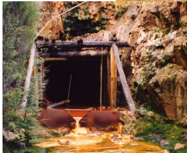
(Above) Acid water generated from acid sulfate soils, northern Australia ( Left ) Acid Drainage from historical mining activities in Tasmania, Australia.

Metal-bearing acidic water generated from ARD and ASS often finds its way into nearby streams, rivers, lakes, and groundwater. This can have extreme ecological impacts, affecting the beneficial use of