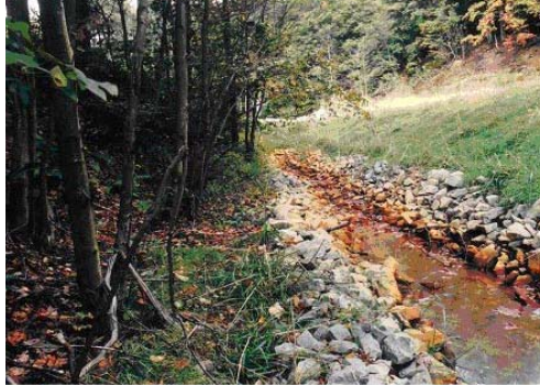
Open Limestone Drain showing a build up of iron precipitates (brown) coating limestone fragments.

There are a number of factors that control the success of passive treatment in dealing with any particular influent water. Of prime importance is the chemistry of the influent waters. For example, when using limestone-based systems (eg. limestone drains) for pH / metal control of acid waters (eg. acid mine drainage), Total Acid Loads of 150kg CaCO<sub>3</sub>/day are generally an upper limit. Above these