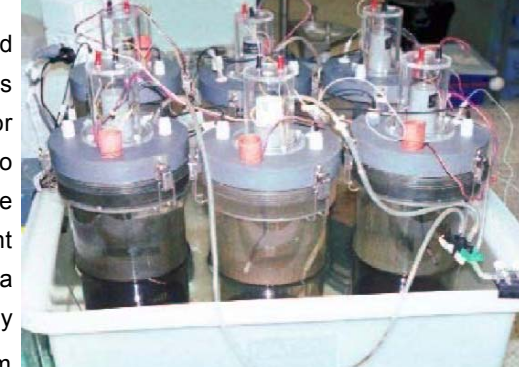
Laboratory testing of nutrient release from sediment cores

While a commercially produced precipitated calcium carbonate was identified as an ideal product for phosphorous control, it was far too expensive to be useful for large-scale nutrient control. Earth Systems has spent almost 2 years searching the world for a more cost-effective but technically suitable variety of precipitated calcium carbonate.