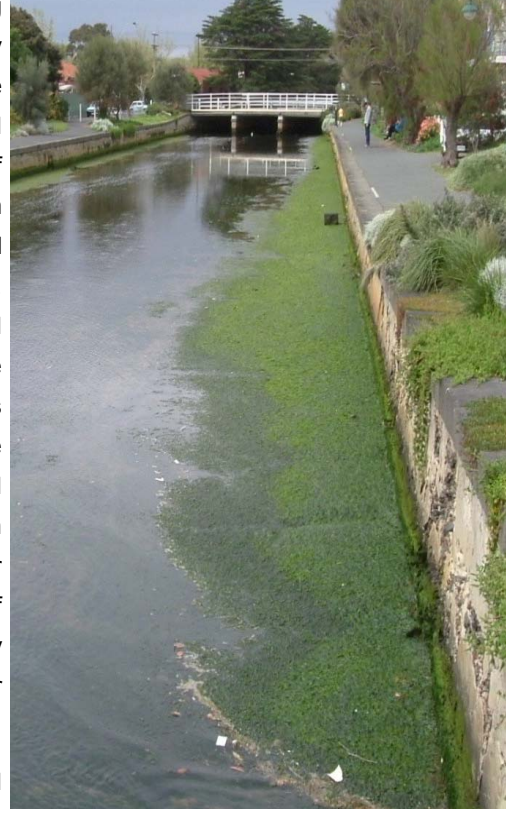
Algae affected water body

Nutrient pollution is an expensive and difficult problem for water managers because it can result in nuisance