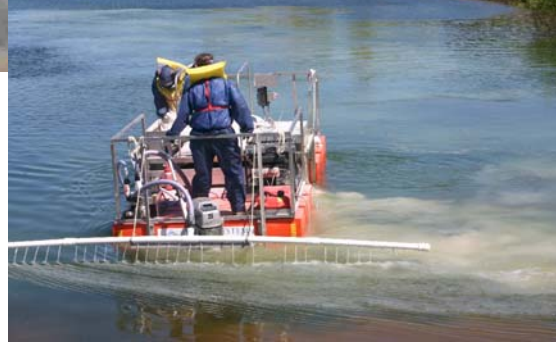
(above) The Neutra-Mill in action