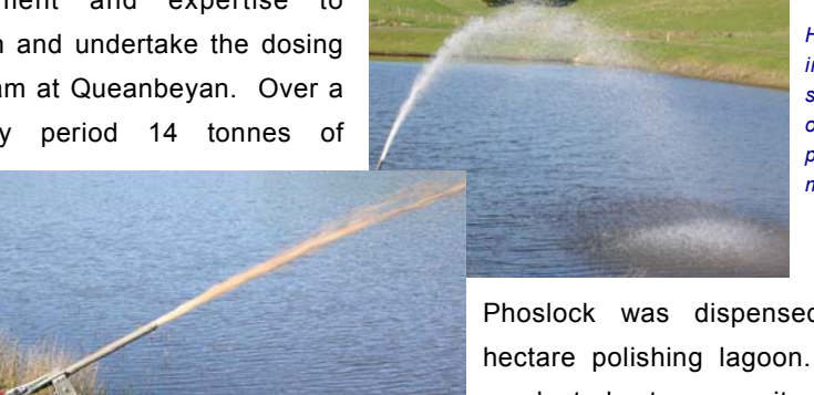
Hydro Slurry spraying over water– the system is capable of distributing a plume up to 20 metres from shore

Phoslock was dispensed into a 5.4 hectare polishing lagoon. Dosing was conducted to permit the uniform deposition of an approximately 1 mm thick blanket of Phoslock across the base of the lagoon. Equipment used included Earth System's patented water-based Neutra-Mill mixing and dosing system (above), and a shore-based hydro-slurry mixing and dispensing system (left).